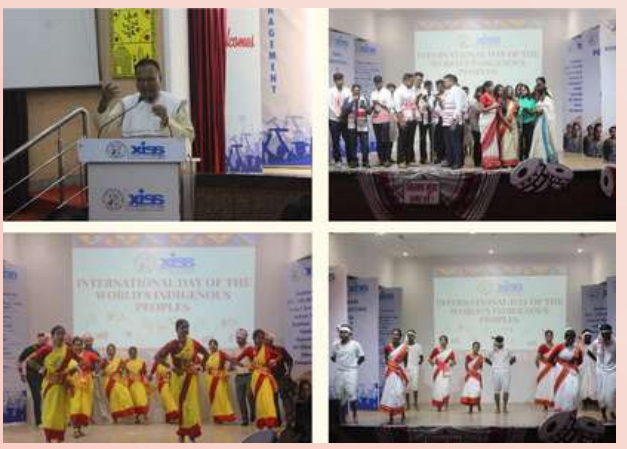
Celebrations during the International Day of the World's Indigenous Peoples