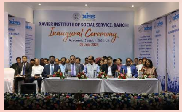
Distinguished guests present during the ceremony