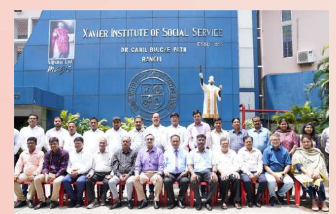
Group Photo of the BRMMC participants

The sessions highlighted the importance of integrating academic and legal theories with practical knowledge and ground realities faced by executives. Sessions were conducted for the first CNT Act 1908 & its implications for Land Acquisition and Coal Bearing Areas (Acquisition & Development) Act 1957 followed by sessions on Land Acquisition Act 1894 & 2013 & Indian Forest Act 1927 and others.