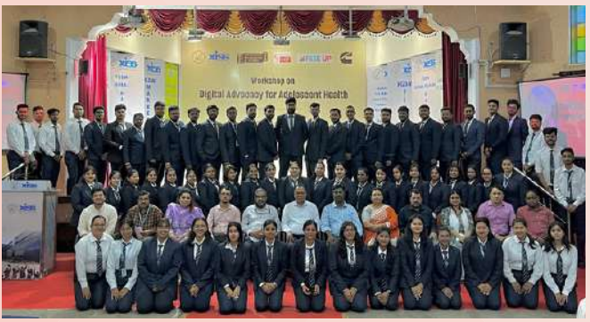
Participants of the Workshop on Adolescent Reproductive and Sexual Health and Digital Advocacy

Head, Rural Management Programme, emphasized the need for advocacy in reproductive and sexual health and hygiene, focusing on curative, preventive, and promotive healthcare. PFI Team discussed the uses of SnehAI, a tool to empower and protect adolescents, and engaged students in activities to raise awareness about ARSH. The workshop also addressed conception, contraception, and the Rashtriya Kishori Swasthya Karyakram, detailing its objectives and implementation.