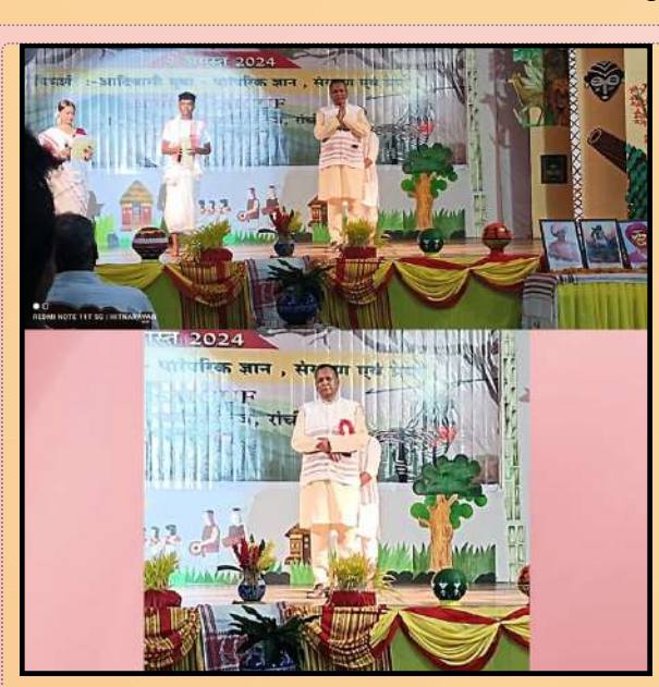
Director, XISS attended the World Indigenous Day celebrations at St Xavier's College, Ranchi on 9 August 2024.

XISS रोवी हाल के वर्षों में उच्च विक्रा में बडा बदलाव आया है। डिजिटल एनुकेशन को इसके महत्वपूर्ण कारक के रूप में देखना चाहिए।