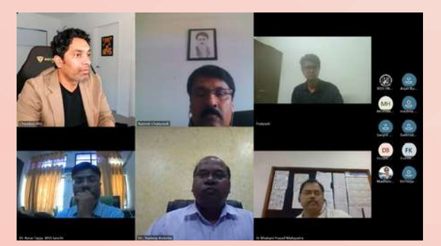
Participants during the Three-day Workshop on Use of Data and Data Analysis in MS-Excel-Business

XISS, Ranchi, and Marketing Management Programme organised a three-day Faculty Development Program-cum-Workshop on Business Modelling and Data Analysis using Ms-Excel via online.