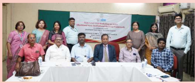
Participants during the Focus Group Discussion Workshop on Jharkhand State Institutional Ranking Framework

Director, XISS, in his address, presented the purpose of the workshop, emphasizing JSIRF as a pivotal initiative for the development of the state's educational institutions. He stated that this is a historical milestone for Jharkhand, providing a model for other states to follow.