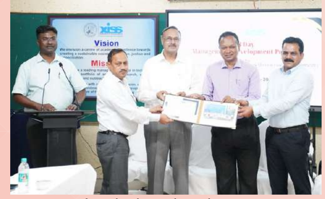
Certificate distribution during the training